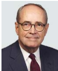
Hon. Dick L. Thornburgh K&L Gates, Washington Pa. Governor 1979-87 Member, 1968 Convention

NONPROFIT ORG. U.S. POSTAGE PAID Pennsylvania Bar Institute